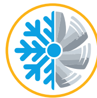
Cold Start Engine Kit