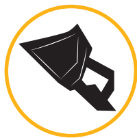
Highest Dump Height