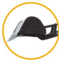
Highest Tear & Breakout Force