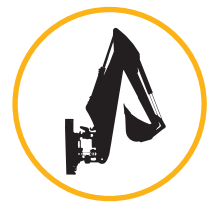
Extending Dipper Arm