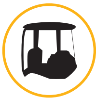
Modern AC Cabin